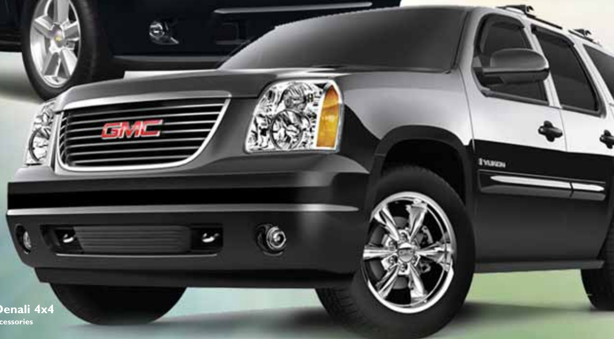
2007 GMC Yukon XL Denali 4x4 With Professional Grade Accessories