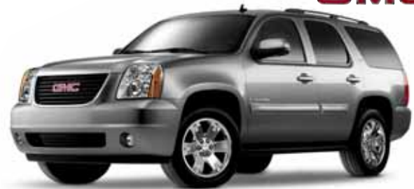
2007 GMC Yukon SLT