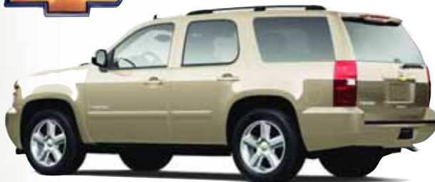
2007 Chevrolet Tahoe LZ