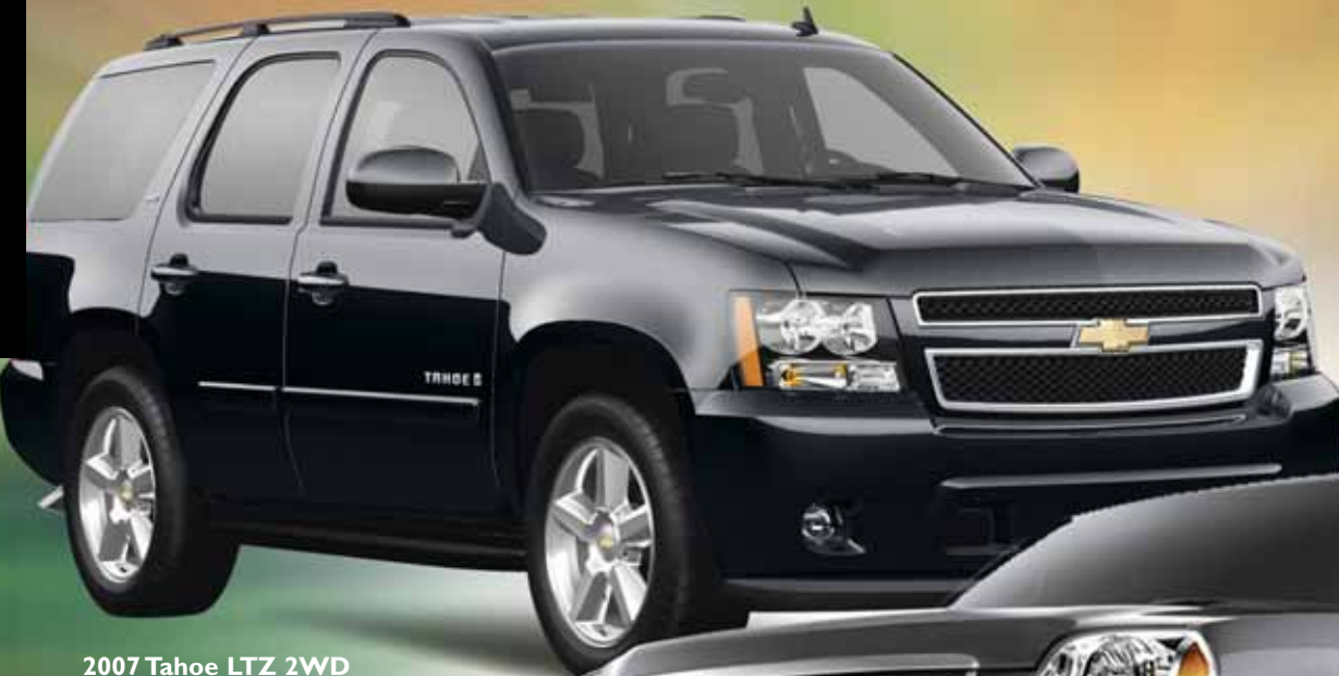
2007 Tahoe LTZ 2WD