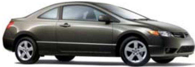
2006 Honda Civic Coupe EX