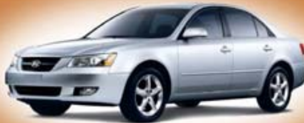
2006 Hyundai Sonata LX

If this sounds too daunting, live vicariously through these three unique sets of wheels, reinvented and all-new for 2006. Buffed up and ready to roll, these three cars are so much more than they used to be.