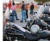
1st Annual Holmes Motorcycle Rally & Bike Show