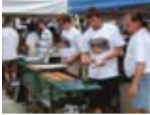
15th Annual Holmes Labor Day Car Show