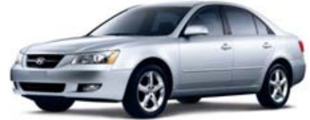
2006 Hyundai Sonata LX

It's a Hyundai like you've never seen before. That's the only way to describe the all-new 2006 Hyundai Sonata. When Hyundai engineers set out to redesign the Sonata, they started fresh, then raised the bar. The result is a sophisticated, spirited sedan offering class-leading safety and standard features.