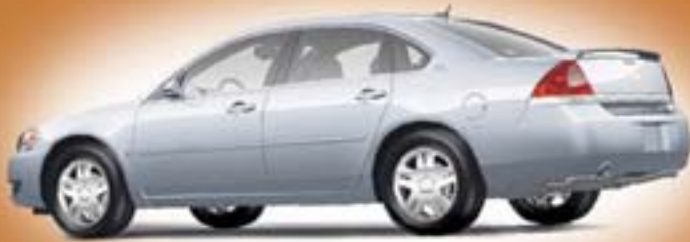
2006 Chevrolet Impala LTZ