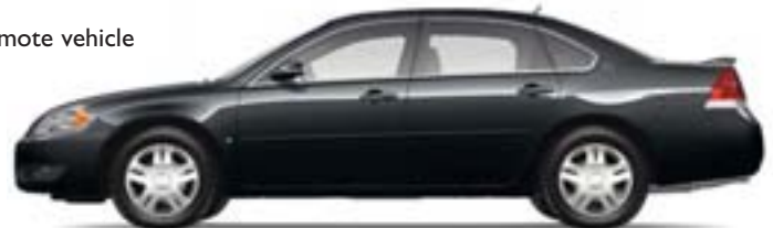
2006 Chevrolet Impala LTZ

For our cold Iowa winters (and hot summers as well), a factory-installed remote vehicle starter system comes standard on all models except the LS. You can start the engine from up to 200 feet away with the simple touch of a button on the remote key fob. You can also start the heater or air conditioner with the key fob to make the car's interior a comfortable temperature when you're ready to go.