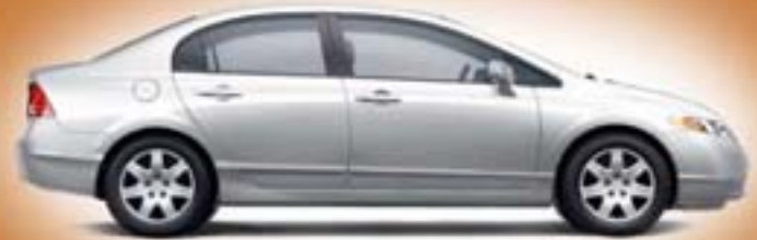
2006 Honda Civic EX